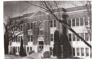
The Honore Mann Lab School circa 1935

This publication is printed and issued by East Central University as authorized by Title 70 OS 1981, Section 3903 25 hard copies have been printed at a cost of $25.