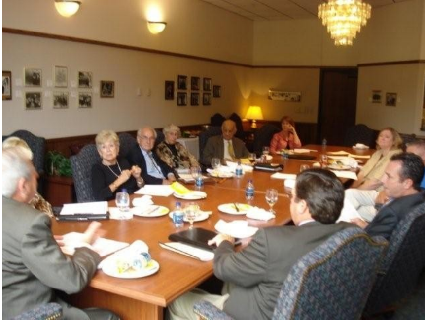
The College of Education and Psychology Advisory Council in Action.

On Wednesday, August 20, 2008, the College of Education and Psychology Advisory Council met in the Governor's Room of the ECU University Center to help develop plans for the college. The purpose of the council is to advise and consult with the Dean for the School and with the Chairs who represent the Departments located in the School. The Council assists in the development of strategic short- and long-term goals that focus on the creation of new opportunities for enhancing the School's many diverse programs and helps to secure financial and other support necessary to achieve these goals.