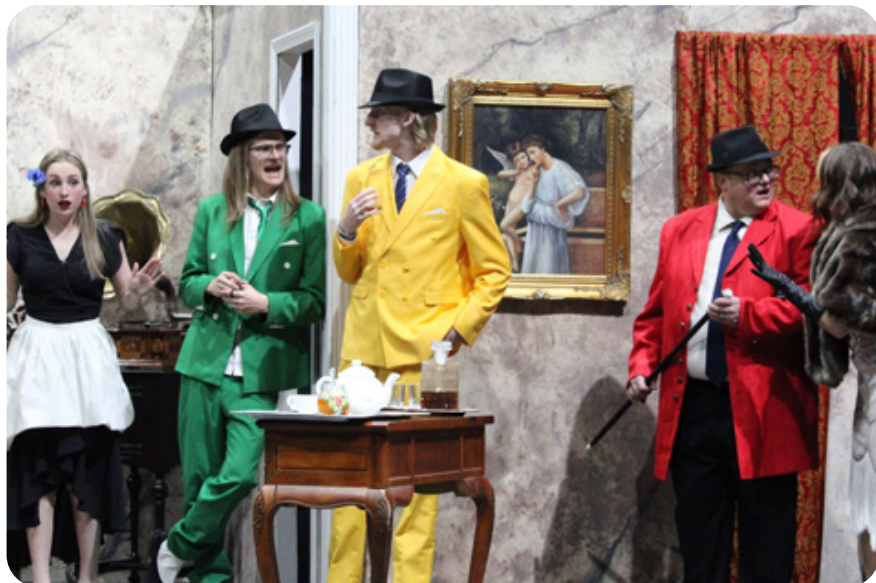
ECU Showtime presented an original production "Death by Chocolate Feb. 15-17 in this mystery dinner show.