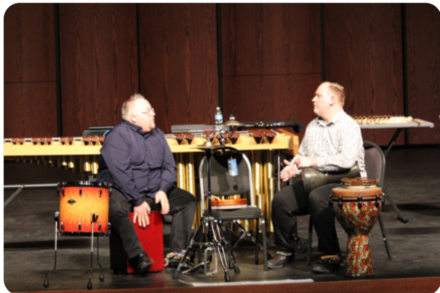
The Quey Percussion Duo brought 20 years of dazzle when they came to ECU on Feb. 15 in Ataloo Theatre.