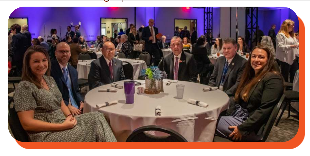
"Uniting for Water: A Collaborative Approach to Integrated Water Resources Management."

This conference aims to bring together experts from various fields to discuss the challenges and opportunities in integrated water resource management. Keynote speakers, panel discussions, and interactive sessions will explore topics such as sustainable water management, innovative technologies, and policy frameworks.