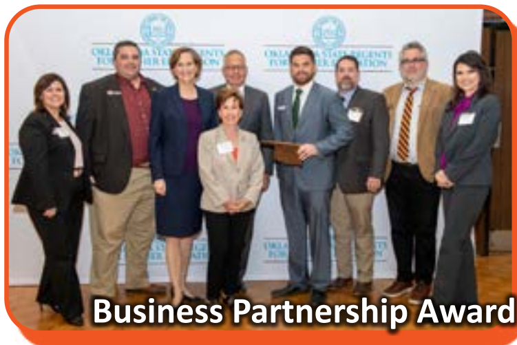
Business Partnership Award

At the Annual OSRHE Business Partnerships Excellence Awards Program, ECU recognized Pontotoc Technology Center as the 2024 Outstanding Partner. Read more at okhighered.org .