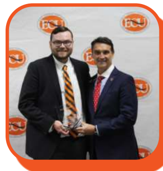
The Dept. of Education awarded approximately $100,000 in scholarships to current ECU students.