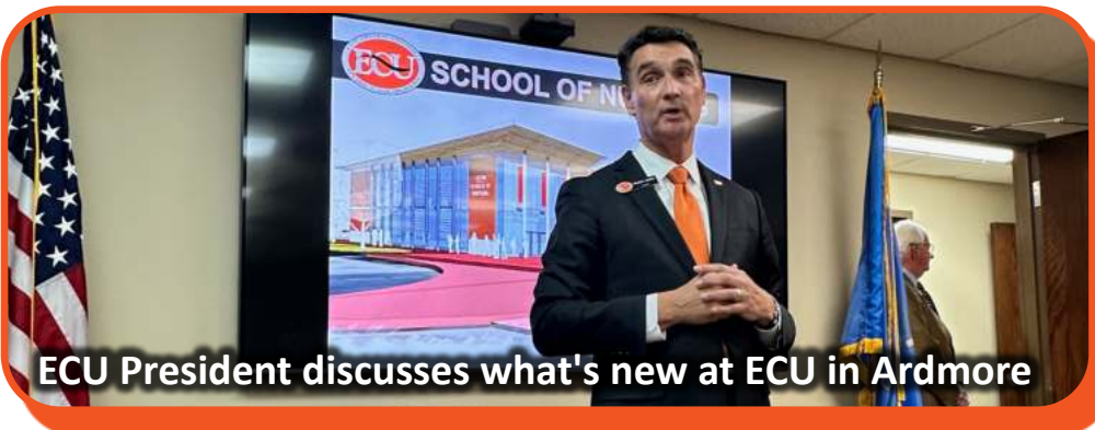
ECU President discusses what's new at ECU in Ardmore