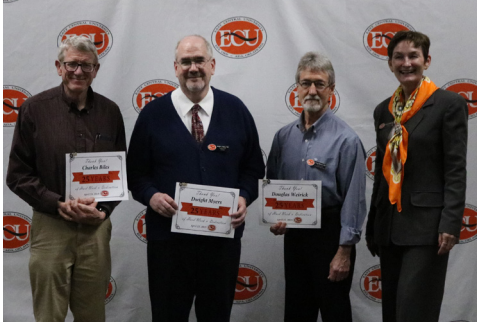
20 years of service to ECU