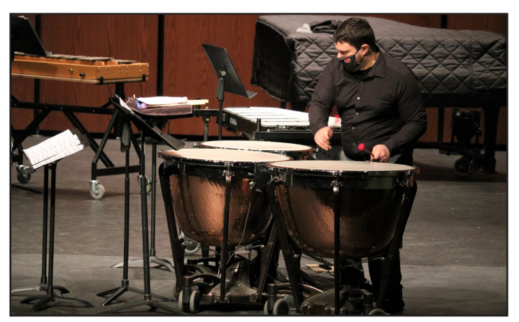
Stress relief, part two In ANOTHER great way to relieve stress, a member of ECU's Percussion Ensemble performs during an invitation-only concert in Ataloa Theatre on November 19.

In what appeared to be a great way to relieve the stress of being cooped up throughout the day, ECU students participated in a friendly game of paintball near Koi Ishto Stadium on November 12.