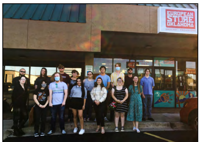
ECU Russian Language students visited the Russian Food Store in Oklahoma City on October 3.