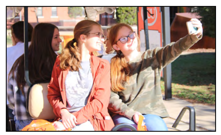
Potential ECU students take a selfie while on a campus tour.