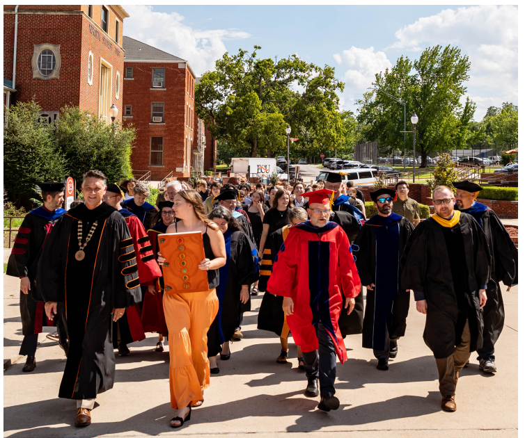
Students and Faculty participate in the traditional Honors March, leading to Honors Convocation.