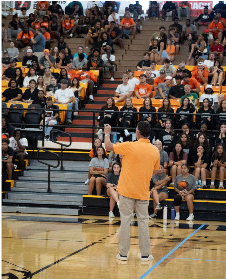
Kerr Activities Center's Welcome to the Dome filled the stands.