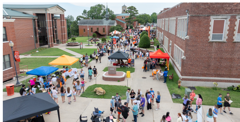
ECU Mall Crawl fills the plaza in front of the Linscheid Library.