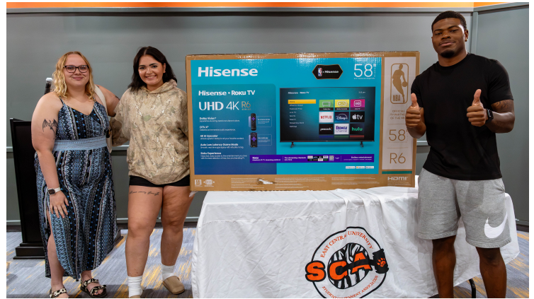
Lucky Tiger Bingo packed the Estep Multimedia Center and saw amazing prizes go out to a number of lucky Tigers.