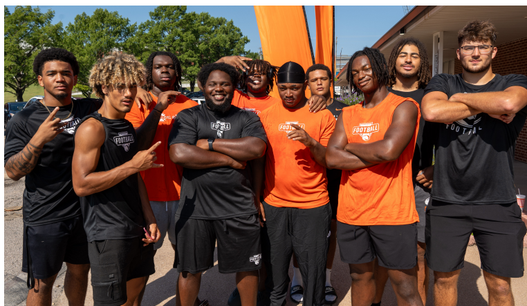
ECU Tiger Football offered their services as ECU's own move-in crew during move-in day.