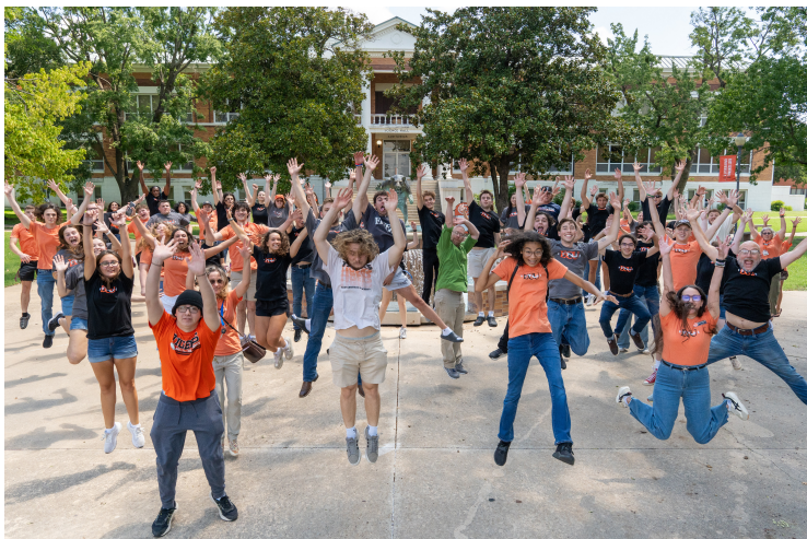
ECU Honors Society for the 2025-26 academic year.