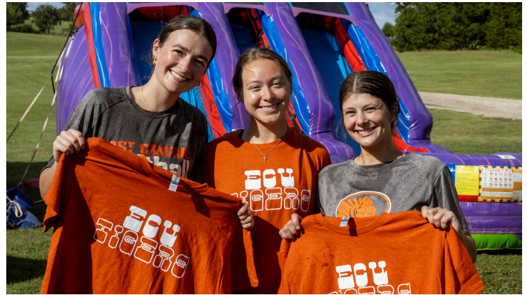
Students had a blast at the Welcome Week Slide & Vibe.