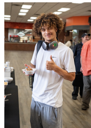
Sweet Treat Thursday