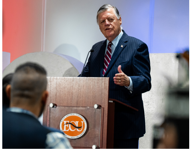
U.S. Representative Tom Cole