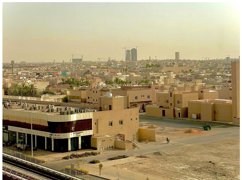
Image of Riyadh, Saudi Arabia