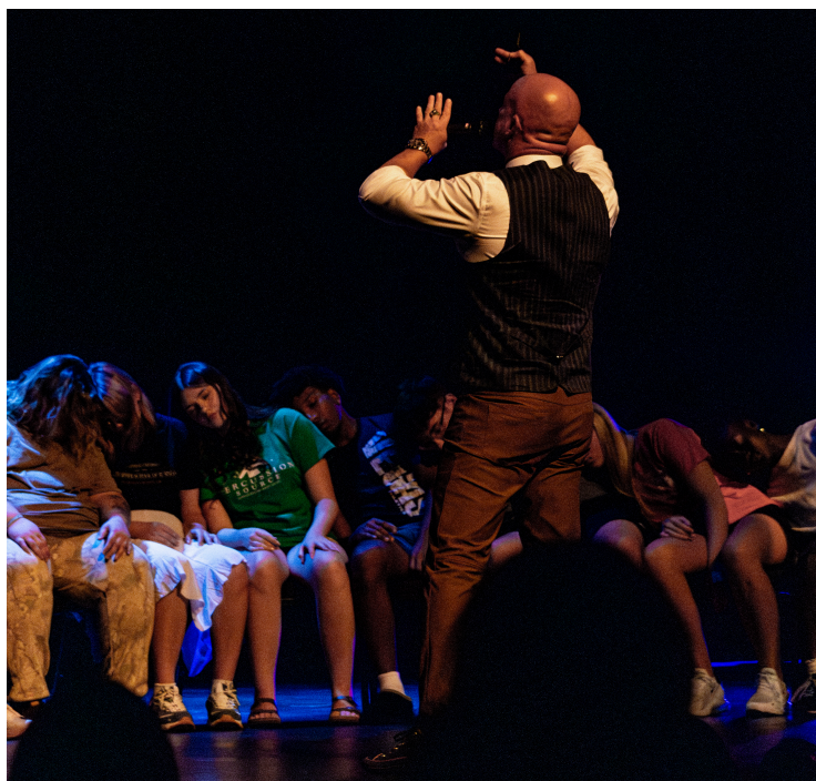
Students participate in a Welcome Week Hypnotist Show.