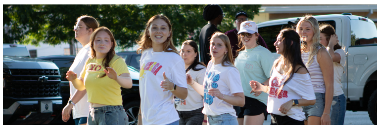
New freshmen came out to Meet the Greeks on the University lawn in front of the Bill S. Cole University Center.