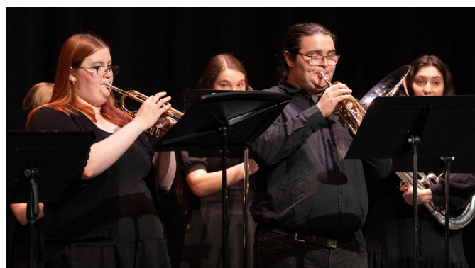
ECU Chamber Ensemble inside Ataloo Theatre