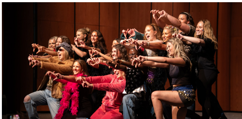
Greek Week Lip Sync Battle