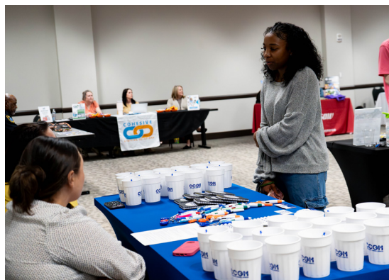
The All Majors Spring Career Fair, organized by the ECU Career Center, saw heavy traffic this April with employers from across the state in attendance.