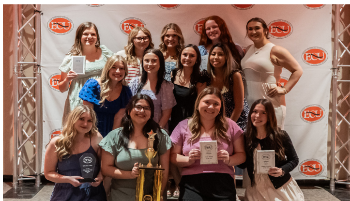
Greek Week Awards

Campus organizations Chi Omega, Zeta Tau Alpha, Gamma Delta Pi, Phi Kappa Tau and Pi Kappa Alpha all participated in this years Greek Week competitions, with Zeta Tau Alpha being named the 2026 Greek Week overall winners.