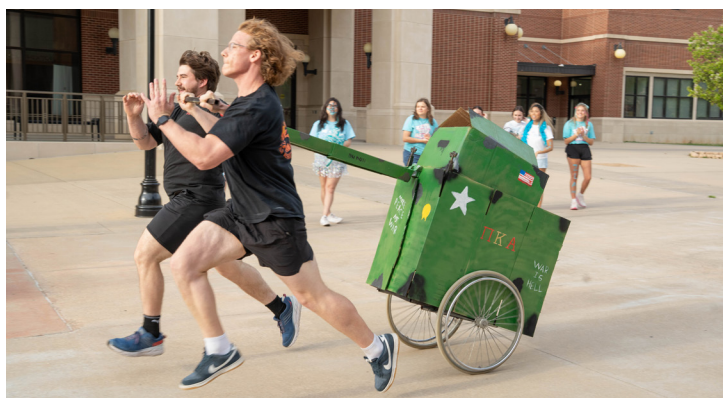
Greek Week Chariot Race