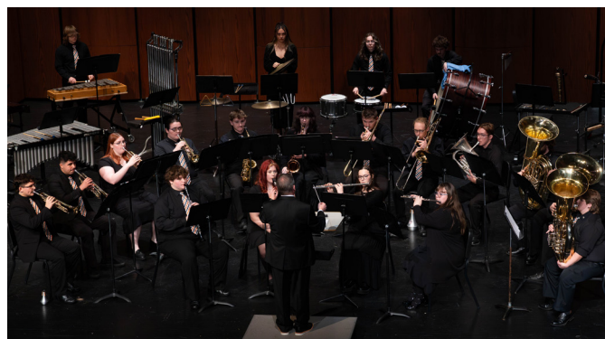
ECU Band Concert inside Ataloo Theatre