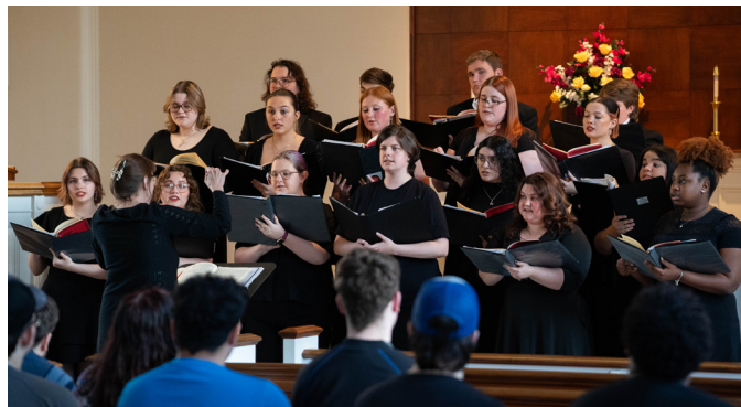
ECU Chorale Concert at First Presbyterian Church