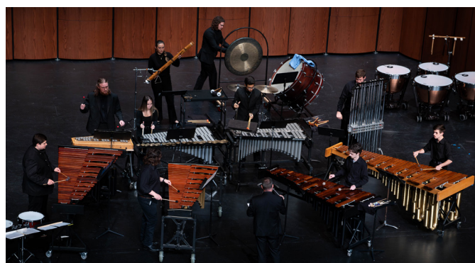
ECU Percussion Ensemble inside Ataloo Theatre