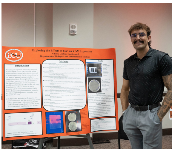
ECU Research Day 2026: Patterns & Process was held inside the Chickasaw Business & Conference Center.

Sponsored by the ECU McNair Scholars Program, The NASNTI REACHE Program and the ECU Honors Program, the event allowed students from the McNairs and Honors Programs to present their research to the public during a Poster Session and later during an Honors Showcase.