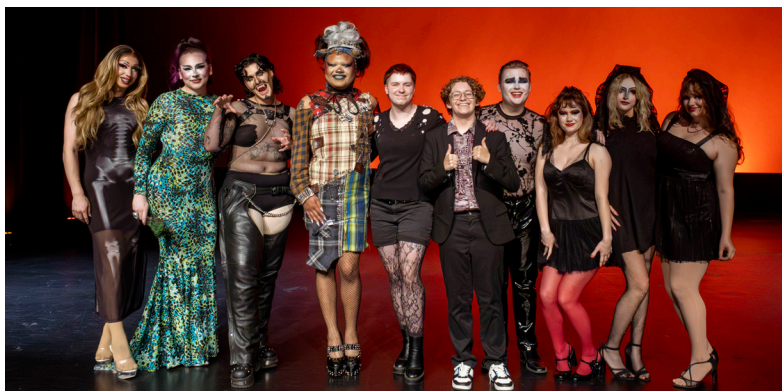
ECU Pride presented Frite Nite Drag Show inside Ataloo Theatre