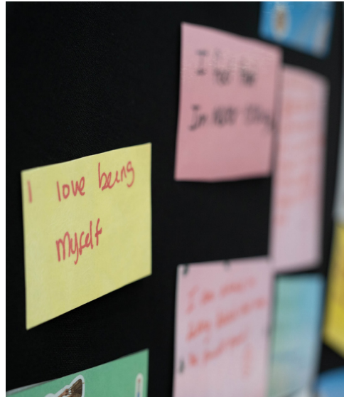
Brave Spaces: Mental Health fair, presented by the Brandon Whitten Institute, was open to the ECU community in March.