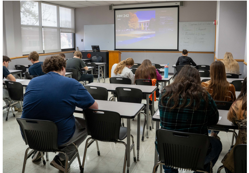
66 students, a record number, took part in the U.S. History exam