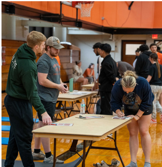
A Kinesiology Health Fair took place and was open for all ECU students, staff and faculty.

Twenty-Five students comprised of English, English Education, Elementary Education, Psychology, Physics, Nursing and Computer Science majors traveled to Tulsa, Okla. to visit the Greenwood Rising Black Wall St. History Center and The Woody Guthrie Center.