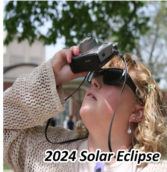
2024 Solar Eclipse