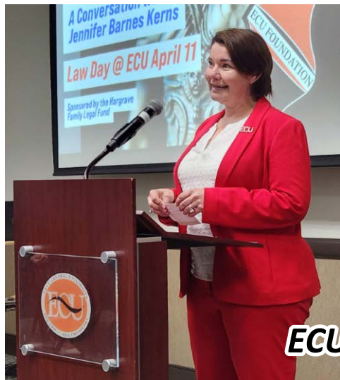
ECU celebrates Law Day