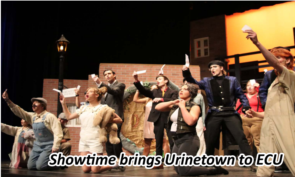
Showtime brings Urinetown to ECU