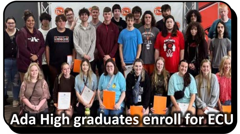
Ada High graduates enroll for ECU

The grant will go towards the construction of the new Nursing/STEM building on the ECU campus. The new facility will house a simulation center and more than 25 hands-on learning labs and STEM classrooms equipped with the latest technology, among many more features. For more information, visit ecok.edu/news .