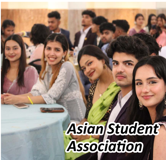
Asian Student Association