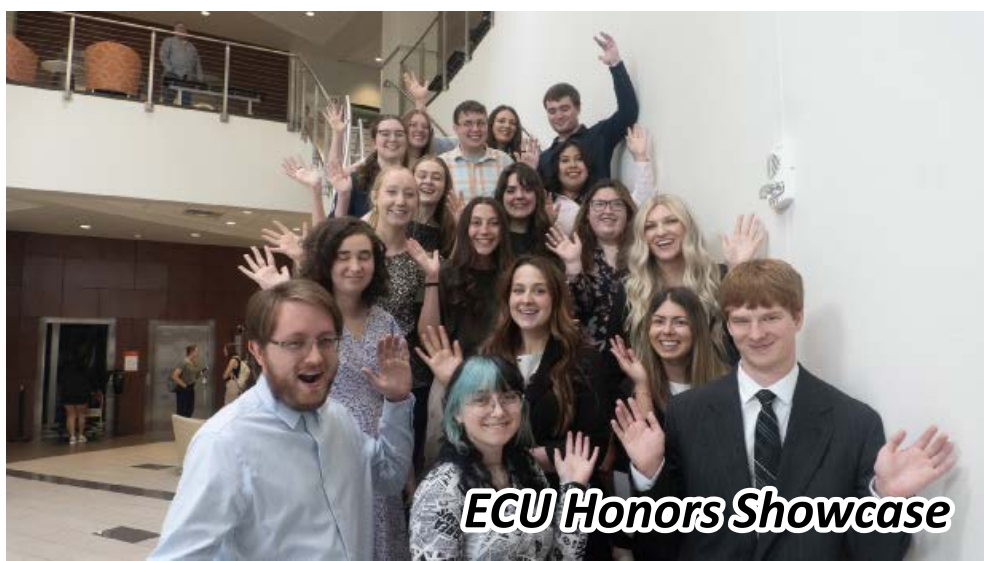
ECU Honors Showcase