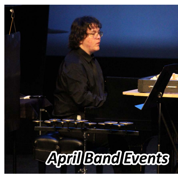
April Band Events