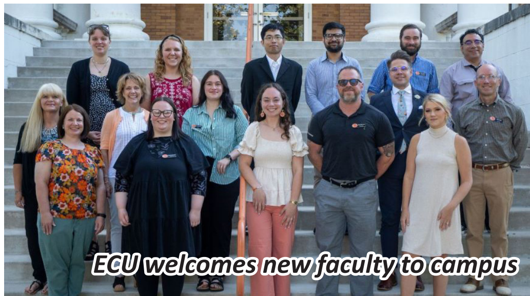
ECU welcomes new faculty to campus

East Central University proudly announced new faculty members for the 2024-25 academic year. For names and bios, visit ecok.edu/news .