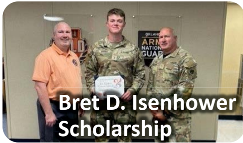
Bret D. Isenhower Scholarship