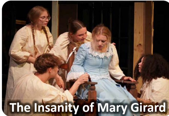
The Insanity of Mary Girard