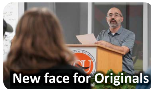
New face for Originals