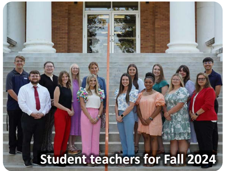
Student teachers for Fall 2024

Tigerpalooza 2024 featured 13 high school bands from across Oklahoma competing at the Koi Ishto Stadium with a special performance by ECU's Pride of Tigerland band. There were more than three thousand spectators in attendance.