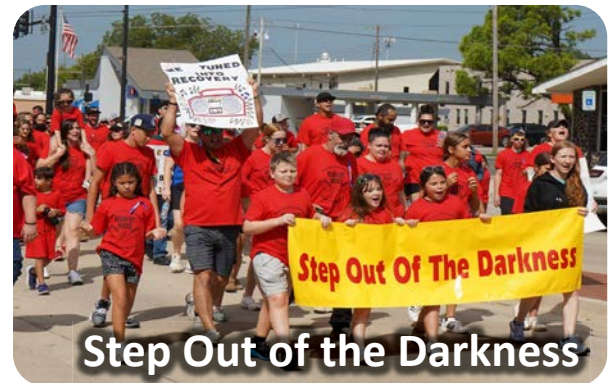
Step Out of the Darkness

The 13th Annual Step Out of the Darkness event returned to Ada Main Street and the ECU Kerr Activities Center in Sept. Hundreds of students, community members and commuters came together for the event sponsored by the Pontotoc County Drug Free Coalition.