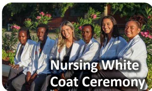
Nursing White Coat Ceremony

Dozens of ECU Nursing students were recently honored at the Fall 2024 White Coat Ceremony in the Ataloo Theatre. Friends, family and ECU faculty and administration were in attendance.