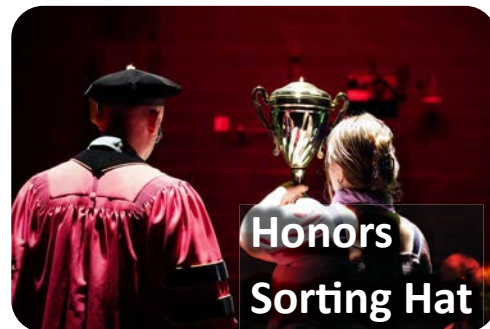
Honors Sorting Hat

The ECU Honor Society has held a series of events, from Honors Convocation to the Honors Sorting Hat and more, throughout Aug. and Sept.