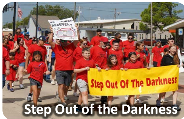
Step Out of the Darkness

The 13th Annual Step Out of the Darkness event returned to Ada Main Street and the ECU Kerr Activities Center in Sept. Hundreds of students, community members and commuters came together for the event sponsored by the Pontotoc County Drug Free Coalition.