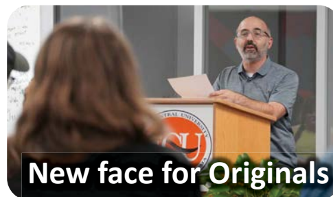
New face for Originals