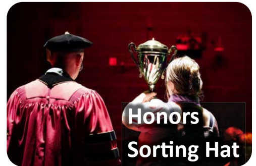
Honors Sorting Hat

The ECU Honor Society has held a series of events, from Honors Convocation to the Honors Sorting Hat and more, throughout Aug. and Sept.