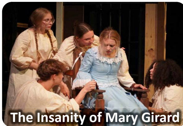
The Insanity of Mary Girard