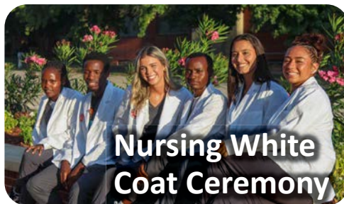
Nursing White Coat Ceremony

Dozens of ECU Nursing students were recently honored at the Fall 2024 White Coat Ceremony in the Ataloo Theatre. Friends, family and ECU faculty and administration were in attendance.