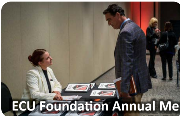
ECU Foundation Annual Meeting was held in Oct.

For more information, visit ecok.edu/news .