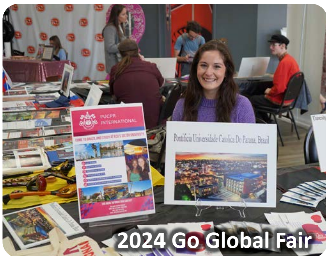
2024 Go Global Fair

Students who participated in the ECU Go Global Program came together to discuss their experiences studying abroad this past year. Joining them were students who have traveled to ECU from across the world to experience the education that can only be offered at ECU.