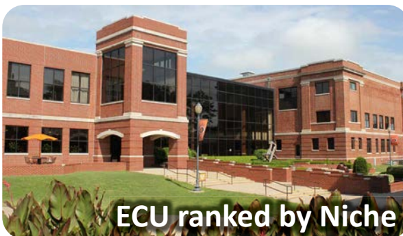
ECU ranked by Niche

For more information, visit ecok.edu/news .