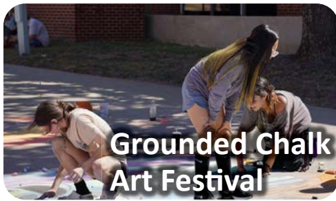
Grounded Chalk Art Festival

The Annual Grounded Chalk Art Festival returned to campus with more than 80 students from K-12 and ECU coming together to fill the ECU Centennial Plaza with art.