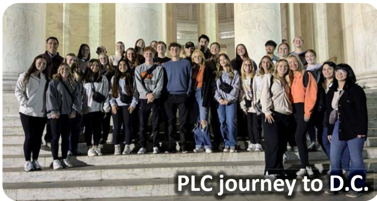
PLC journey to D.C.

The 70th Annual Faculty Art Exhibit saw several faculty members, including two new members of the ECU family, enter a wide variety of eye-catching exhibits.