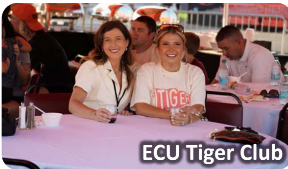
ECU Tiger Club

For more information, visit ecok.edu/news .