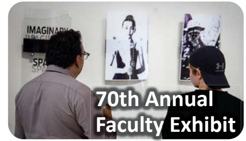
70th Annual Faculty Exhibit

The instrumental music of Gabriel Fauré was performed by ECU students and faculty in honor of the 100 Year Anniversary of the French composers music.