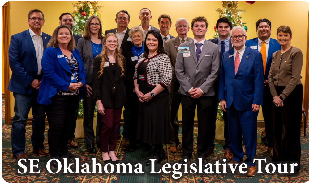
SE Oklahoma Legislative Tour

Representatives from ECU and other Southeast Oklahoma universities joined state legislators to discuss the future of higher education and its impact on Oklahoma's economy and workforce.