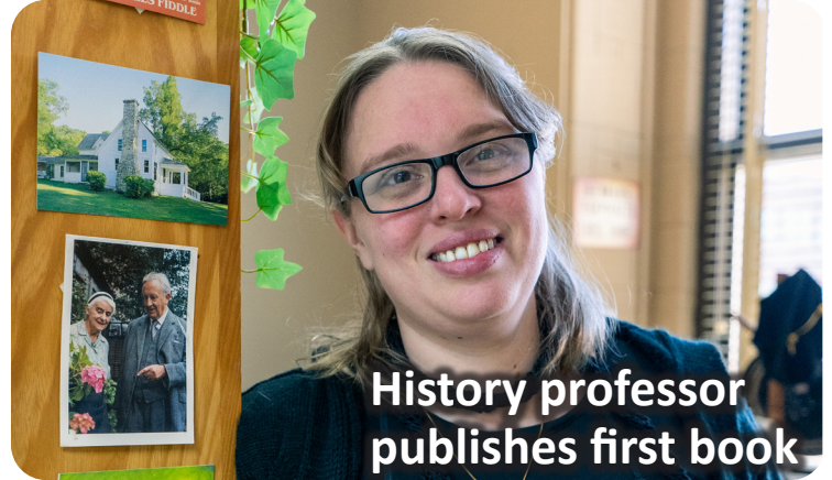
History professor publishes first book