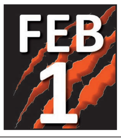
The deadline for scholarships looms. If a student applies by Feb. 1, they will be considered for a University scholarship. To apply for ECU Foundation scholarships, visit: ecok.edu/scholarships