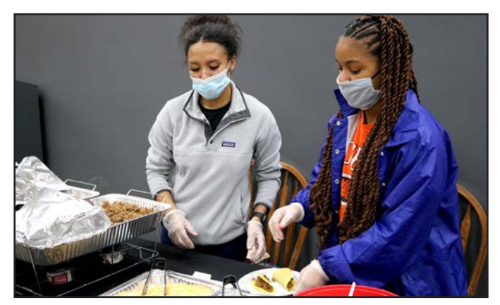
Tacos were served on Taco Tuesday, Jan. 11, to welcome students back to campus for the spring semester.