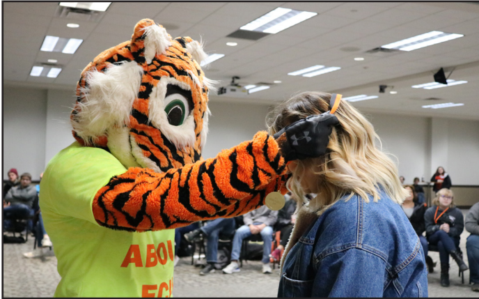
Roary Tiger awards an unidentified area high school student a medal for her performance at ECU's 101st Interscholastic Meet on February 11. Several hundred competitors descended on campus for the event and were treated with fun activities and tours between academic contests.