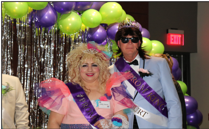
ECU students aren't the only ones having fun on campus. The Pontotoc County Drug-Free Coalition held its fifth annual gala, disguised as an 80's prom murder mystery, in the Chickasaw Business & Conference Center on February 7.