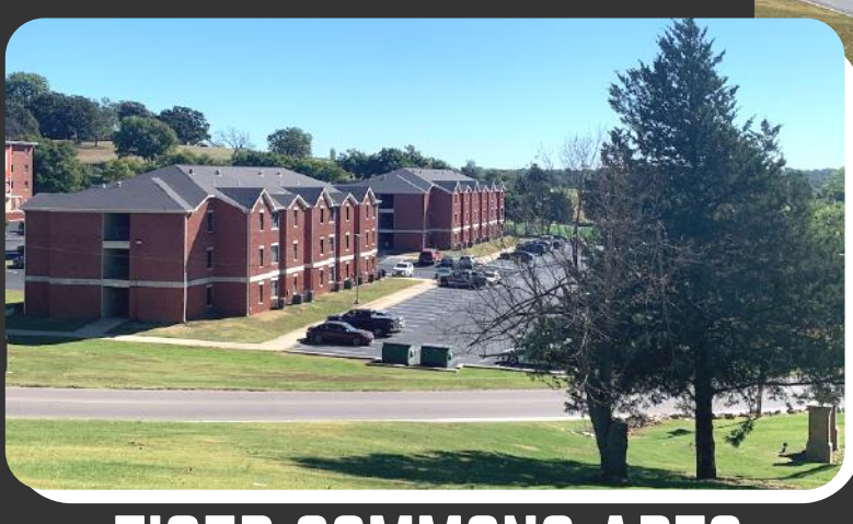
TIGER COMMONS APTS.