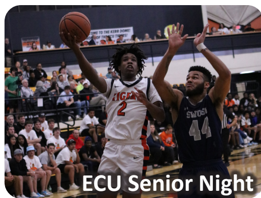
ECU Senior Night