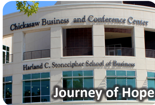
Journey of Hope

The Pontotoc County Drug Free Coalition held their annual Gala on the ECU campus with members of the community and ECU administration in attendance. PCDFC is a local group of volunteer community members collaborating in an effort to prevent substance abuse and promote recovery.