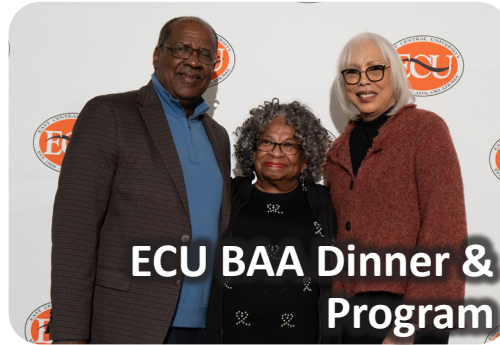
ECU BAA Dinner & Program