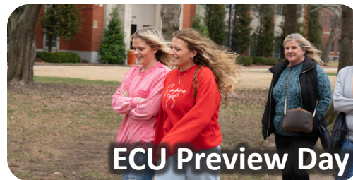
ECU Preview Day

The spectacular fusion of music, dance, theatre and live painting known as Artrageous came to the Ataloo Theatre. Community members came together to participate in activities, enjoy the show and give the nationally recognized cast of Artrageous an exciting ECU and Ada welcome.