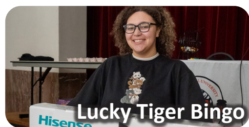
Lucky Tiger Bingo