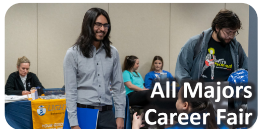
All Majors Career Fair